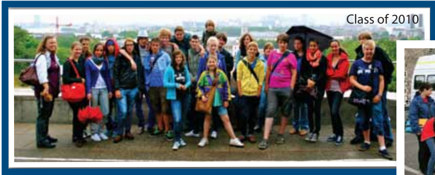
Class of 2010

Daily outings into Canterbury for sports or shopping - your choice!