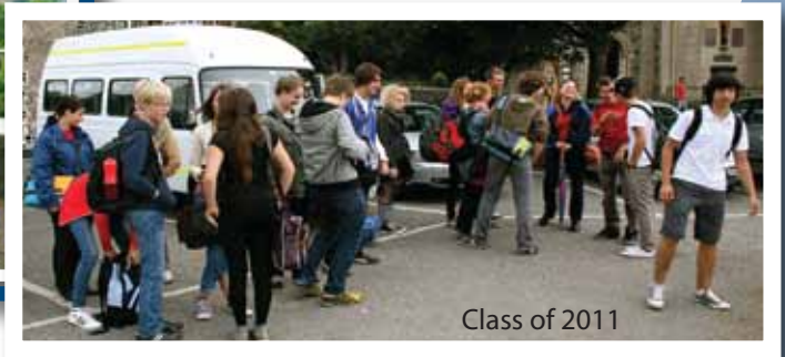
Class of 2011